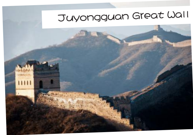
Juyongguan Great Wall

No optional tours! Limited 5 mandatory shopping stops: ★ Pearl ★ Silk ★ Tea ★ Bao Shu Tang ★ Bamboo Charcoal